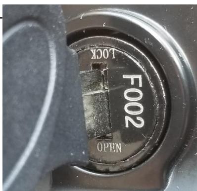
Battery Locked On the Holder