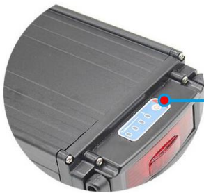
Battery level Indicator